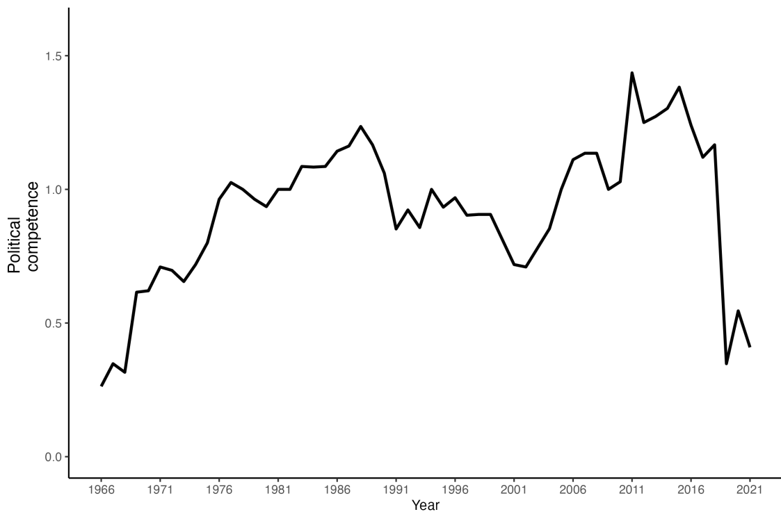
Figure 3: Average political competence level in Iraq

reaches its max in 2017 before it starts declining again slightly. We see that in the Maoist period (until 1976), the technical competence level of the cabinets remain relatively low and declining slowly, but the same trend is not as clear under the other state leaders. Although we do see a slight decrease in the average technical competence level of Chinese cabinets in recent years, it is unclear whether this is just a stagnation or whether the trend will continue with further decreases in the future.